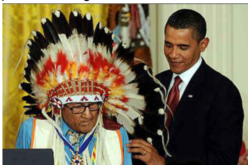
President Barack Obama awards Joseph Medicine Crow (Apsaalooke [Crow], 1913-2016) the Presidential Medal of Freedom, Washington, D.C. August 2009. The Apsaalooke [Crow] people named Medicine Crow a war chief for his military exploits in Europe during World War II.

Despite this tragic history, many American Indian men and women have served in all branches of the military. In many conflicts and wars, including World War I and World War II, American Indians honorably defended their homelands and the United States.