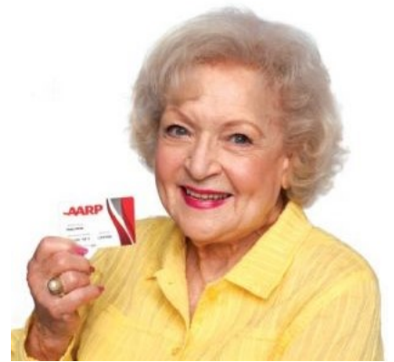
AARP National + AARP Chapter 1952

"Think joining AARP makes you old? Get over it. "