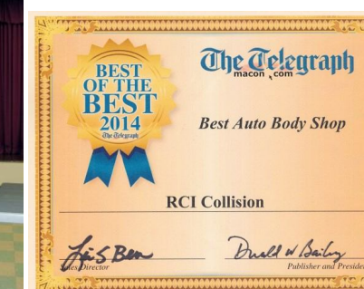
Business Spotlight: RCI Collision!

interpretations of black womanhood and also used her gifts to champion for Human Rights. Dee was cremated, and her ashes are held in the same urn as that of Davis, with the inscription "In this thing together" .