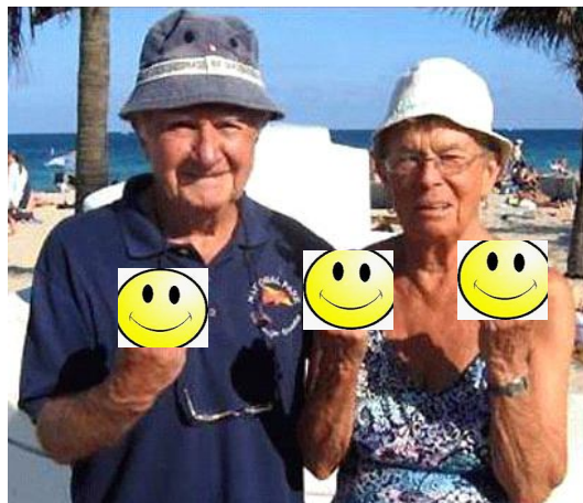
Grandpa and Grandma "waving" at their favorite grandchildren! 😊