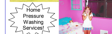
Over thirty years experience at getting the job done right!