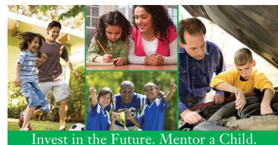
Invest in the Future. Mentor a Child.

January 3, 2012: President Barack Obama has issued a proclamation designating January as National Mentoring Month , saying, "Every day, mentors help young Americans face the challenges of growing into adulthood. By setting a positive example and sharing their time, knowledge and experience, mentors play an essential role in preparing our Nation's youth for a bright future. During National Mentoring Month, we celebrate the contributions of all those who cultivate a supportive environment for the next generation, and we recommit to expanding mentorship opportunities across our country."