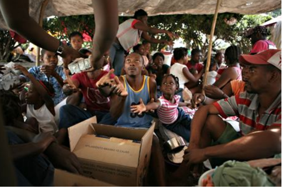
The United Nations World Food Program hands out supplies in Port-au-Prince, Monday, Jan. 18.

<c< EARTHQUAKE (Continued) You'll also want to know whether the charity is providing direct aid or raising money for other groups. Either can be worthy, but you may consider avoiding a middleman by giving to a group with an on-the-ground presence in Haiti.