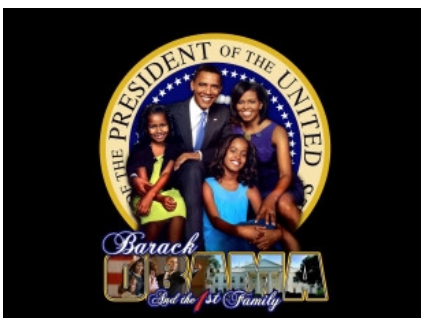
President Barack Obama (44th President Of The United States Of America), First Lady Michelle Obama, Daughter Natasha "Sasha" Obama (Left) And Daughter Malia Ann Obama!