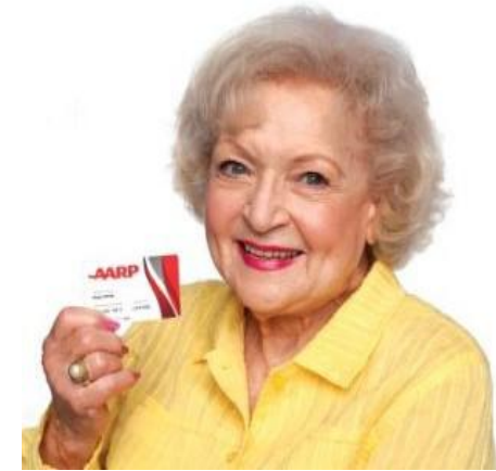
AARP National + AARP Chapter 1952

"Think joining AARP makes you old? Get over it! "