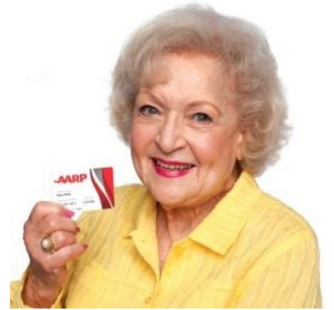
AARP National + AARP Chapter 1952

"Think joining AARP makes you old? Get over it! "