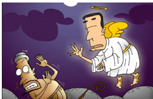
Fear not, for I bring you good news ... I just saved a ton on my auto insurance by switching to GEICO!

Santa was getting ready for his annual trip ... but there were problems. Four of his elves were sick and Santa was beginning to feel the pressure of being behind schedule. Then Mrs. Claus reminded Santa that her mom was coming to visit, which stressed Santa even more. And when he went to harness the reindeer, he found that three of them had jumped the fence and were out wandering around, heaven knows where. As he began to load the sleigh, an open toy bag fell to the ground, spilling out a bunch of toys onto the snow. Santa was so frustrated he decided to take a break. He went into the house for a cup of coffee and a shot of whiskey. But the coffee pot was empty and the elves had hidden the liquor. To make matters worse, he dropped the empty coffee pot and it broke into shards all over the kitchen floor. With a heavy sigh, he went to get the broom and found that mice had eaten the straw it was made from. Just then the doorbell rang and Santa cussed in a very un-Merry fashion all the way to the door. He flung it open and there stood a little angel with a great big Christmas tree. The angel said, "Where would you like to put this tree, Santa?" And that, my friends, is how the little angel came to be on top of the Christmas tree!