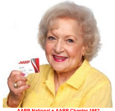
AARP National + AARP Chapter 1952

"Think joining AARP makes you old? Get over it."