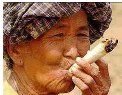
Sometimes it's okay if the only thing you did today was breathe. However ...

You do know what would have happened if it had been three wise WOMEN instead of men, don't you? They would have asked for directions, arrived on time, helped deliver the baby, cleaned the stable, made a casserole, and brought disposable diapers as gifts!