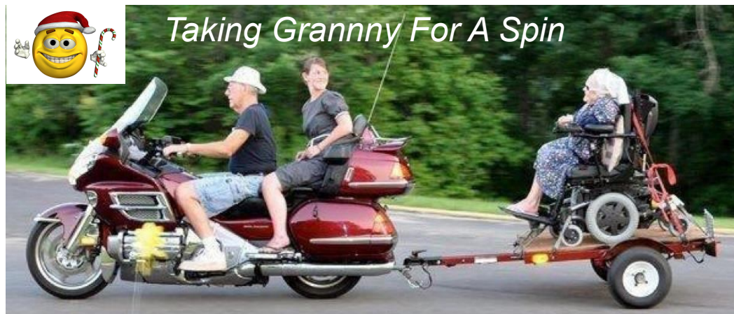
Taking Granny For A Spin